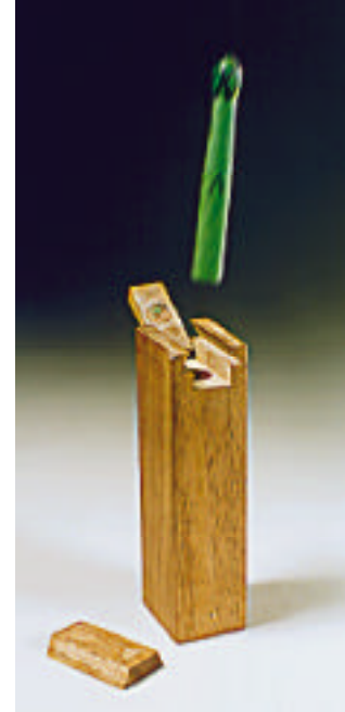
Cupid's Love Tip