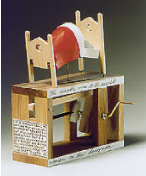
The Honeymoon Bed

The Honeymoon Bed is another 14 Ball Toy Co. production. A bouncing bed is a joke easy to dismiss as crude and obvious but in this case it's better just to buy it and laugh. Trust me. Height 14cm, W 11.5cm, D 4.5cm. £79-90